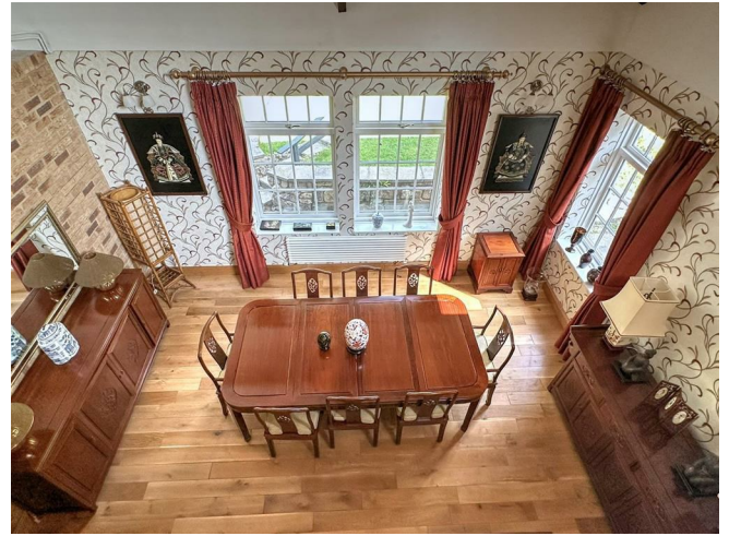
IMAGE FROM UPPER LEVEL